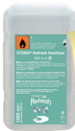
Hand disinfection gel STOKO® Refresh Sanitizer – Gel (2-A)

TESTED ACCORDING TO EN 1500! EFFECTIVE AGAINST EHEC!