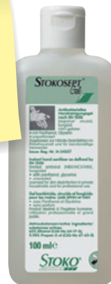
Hand disinfection "on the move" STOKOSEPT® Gel

TESTED ACCORDING TO EN 1500! EFFECTIVE AGAINST EHEC!