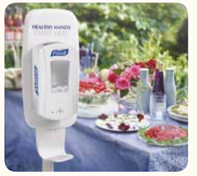
The dependable germ-fighting protection of PURELL Advanced Hygienic Hand Rub in restaurants and employee locations