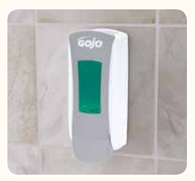
Spa-inspired GOJO hand and body products in showers.