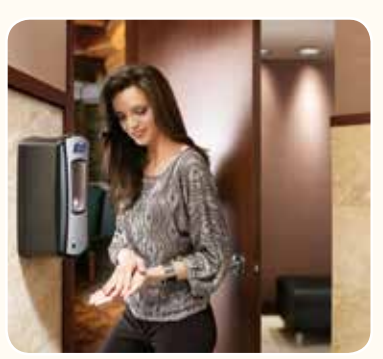
Use GOJO® soaps and PURELL<sup>®</sup> products in washrooms.